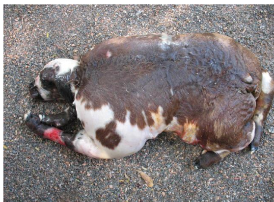
Fig. 3: Bull Dog Lamb Associated with Foetal Anasarca.