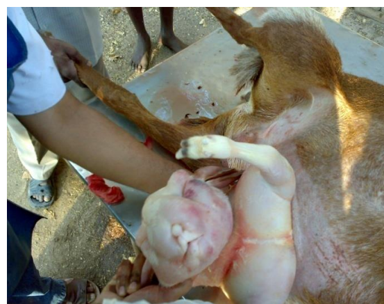
Fig. 2: Delivering the Anasarca Foetus from Uterus.