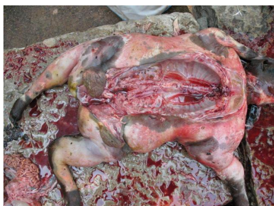
Fig. 4: Dissected Foetus with Narrow Body Cavities.