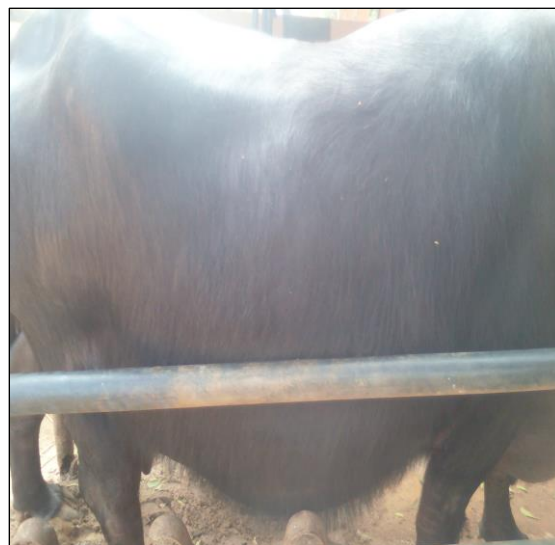
Fig. 1: Buffalo with Capacious and Pendulous Abdomen.

The present case recorded the recurrence of uterine torsion due to predisposition by maternal roomy abdomen, fetal sex and weight.